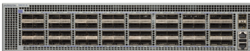
Arista 7260CX3-64: 64 x 40/100GbE QSFP100 ports, 2 SFP+ ports

With support for a flexible combination of speeds including 10G, 25G, 40G, 50G and 100G and combined with Arista EOS, the 7260CX3-64 delivers rich features for big data, cloud, virtualized and traditional designs and accommodates the myriad different applications and east-west traffic patterns found in modern data centers.